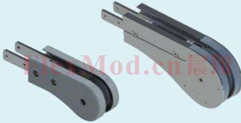
CXSEJ 320 Idler end unit(从动单元)